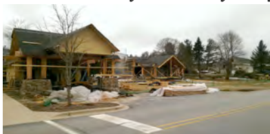
Kelsey Hutchinson Park

The Kelsey Hutchinson Founders Park Coalition had a productive meeting on January 8th. It was our first post holiday get-together and our first opportunity to review preliminary plans for the inclusion of what we are now calling Phase 2. This is the now-leveled, former Sossomon property on Oak and Pine Street Alleys.